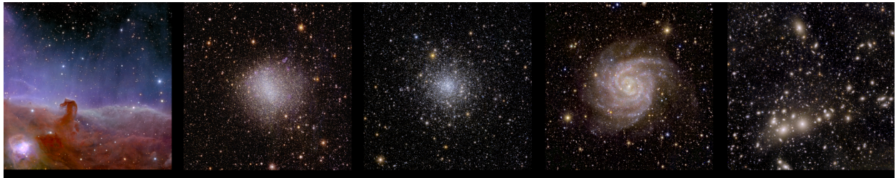
The five first Euclid ERO images. See footnote for details.

An Early Release Observations program was conducted during Euclid 's first months in space as a first look at the depth and diversity of science Euclid will provide. A total of 24 hours was allocated towards specific targets chosen to produce stunning images, also relevant for scientific research. Five of these images were released in November, 2023. The remaining five are being published today, May 23rd, 2024, by ESA 12 .