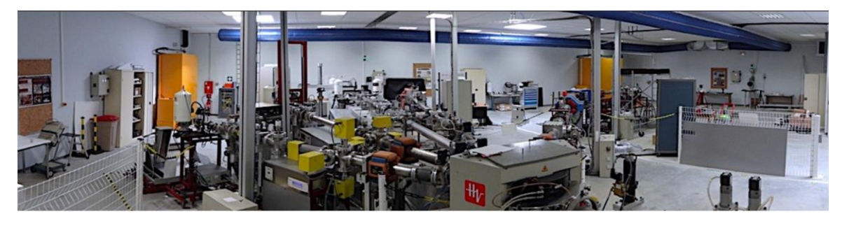
Figure 2: Panoramic view of the AIFIRA experimental hall